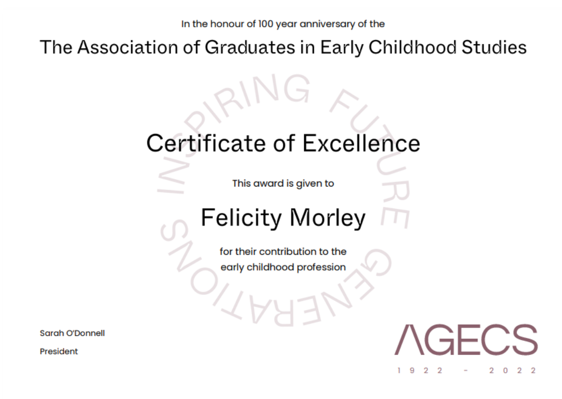
Figure 1: Certificate of Excellence

The '100 Years of Excellence Awards' were then brainstormed as a way to reward excellent teachers and educators, and to generate feelings of gratitude between colleagues or for oneself. The committee wanted teachers and educators to receive both recognition as well as some kind of financial benefit. The group discussed vouchers to social enterprises, and chose Magabala Books, a First Nations online book retailer and publisher. Each awardee was gifted a $200 Magabala Book Voucher and a signed certificate of excellence (Figure 1).